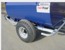
HEAVY DUTY AXLES, WHEELS AND TYRES