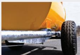
REINFORCED GALVANISED TUBULAR STEEL CHASSIS FOR EXTRA STRENGTH AND DURABILITY