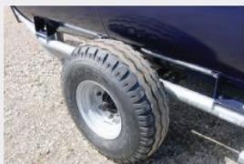
FLOTATION TYRES FOR ROUGH TERRAIN