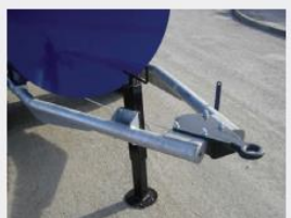
HEAVY DUTY TOWING HITCH