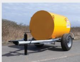
1,000 LITRE SITE TOW DIESEL BOWSER