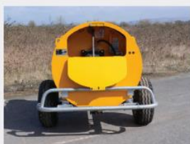
LOCKABLE FUEL DISPENSING CABINET WITH FOLD DOWN DOOR